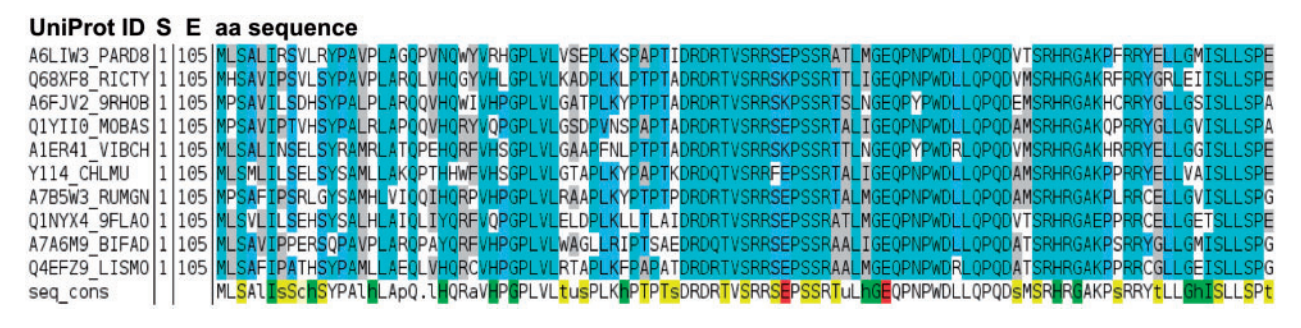
Figure 1. Seed alignment for the AntiFam family derived from PF10695. Amino acids are colored by average similarity according to the BLOSUM62 amino acid substitution matrix from most similar (light blue) to less similar (gray). 'S' and 'E' in the first row stand for sequence start and sequence end, respectively. The final row features a consensus sequence. The alignment was displayed using the Belvu software (http://www.sanger.ac.uk/resources/software/seqtools/).

AntiFam is a freely available collection of multiple sequence alignments and profile HMMs. These models are designed to identify commonly recurring spuriously predicted ORFs. Some of the multiple sequence alignments used are taken from the Pfam database seed alignments for families identified as spurious ORFs. These alignments are kept as they appeared in the final release of Pfam before they were withdrawn (Table 1). Several additional custom families have been created to identify other commonly recurring spurious ORFs (Table 2). The profile HMMs have been constructed using the HMMER3 package with default parameters (13). The profile HMM library can be searched against any set of protein sequences using the 'hmmsearch' command. Due to the speed of the HMMER3 package, searching a sequence database such as UniProtKB will take a few